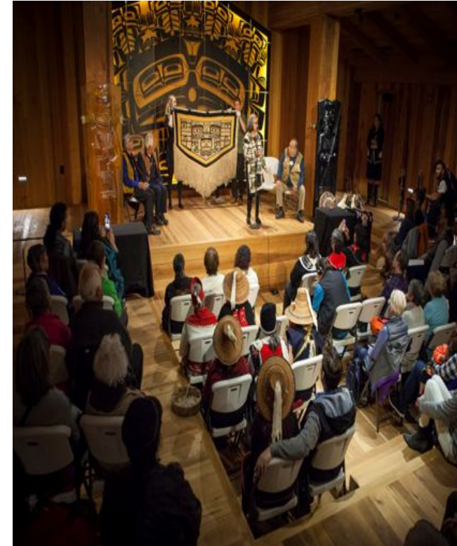
SHI Chilkat Robe 2017 Gift Ceremony • 25,000 Facebook reaches