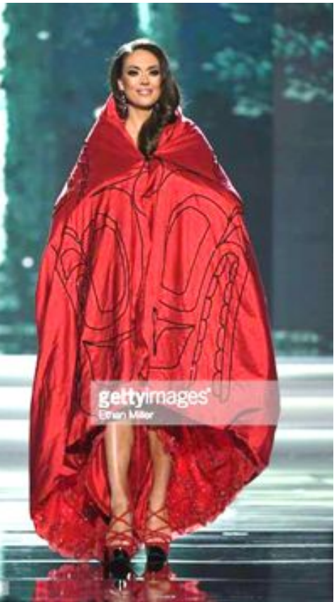
Alyssa London 2017 Miss USA Pageant 10 million viewers Top 10 finalist Cape design by Preston Gletary (Tlingit)